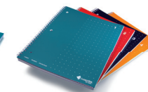
Single Subject Notebooks